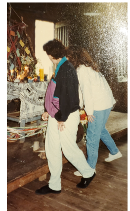
Blast from the past - an event prior to the construction of the Treehouse. The Rec Hall only had shutters in its windows, no glass yet.